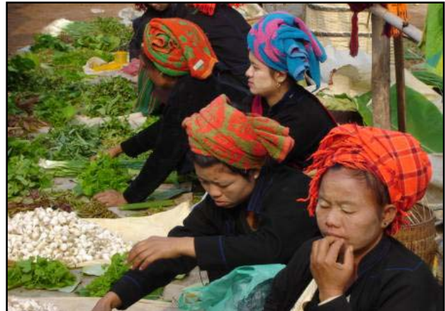
At the Market