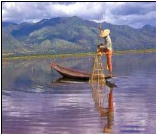
Inle Lake Fisherman